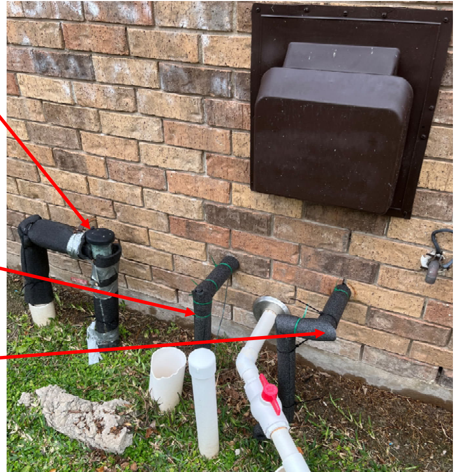
Water fill line to pool