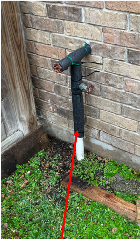
Clubhouse Water Inlet