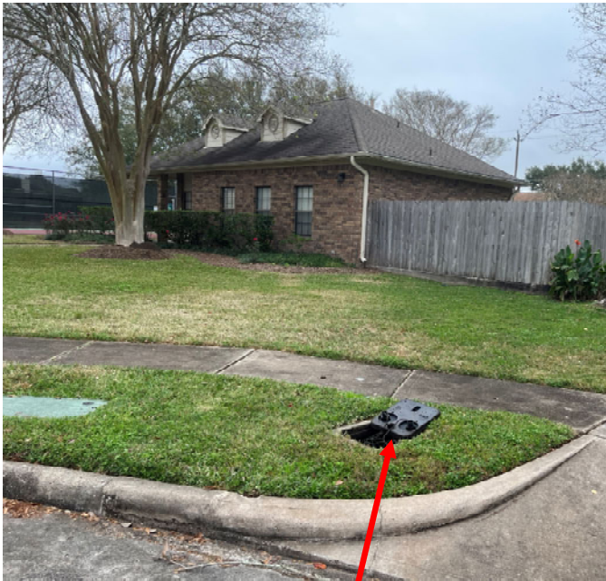
Water Meter Box

Clubhouse Meter Valve Valve (Currently Closed) ONLY Close this valve